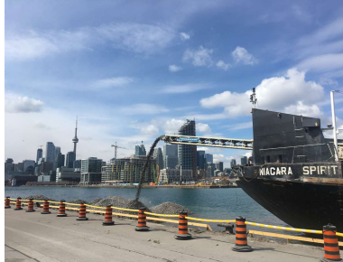
McKeil Marine's Niagara Spirit offloading in Toronto.

All winter long, Picton Terminals in partnership with McKeil Marine, barged surplus limestone from the PT redevelopment project to Amherst Island and Toronto Harbour. We are nearing the end of those contracts and are appreciative of the crews, in all locations, who help to provide safe and efficient work environments on land and on water. Picton