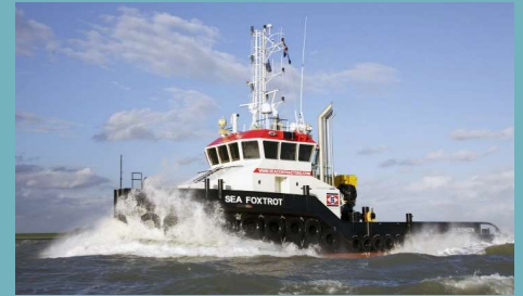
Damen Shoalbuster tug.

Picton Terminals is currently hiring crew to travel between Picton and Toronto weekly (Sunday am to Thursday pm) from July 1 to December 31, 2020, 2021 and 2022.