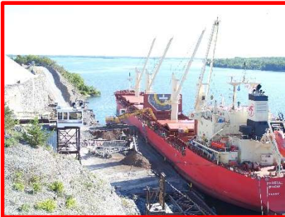
Federal Biscay Sept. 2016 @ Picton Terminals