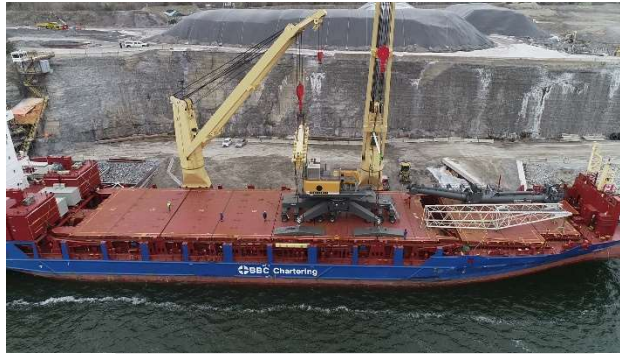
BBC Rushmore cargo vessel.

We are grateful for the many Picton Terminals partners across the region, who help supply our visitors with a myriad of goods and services.